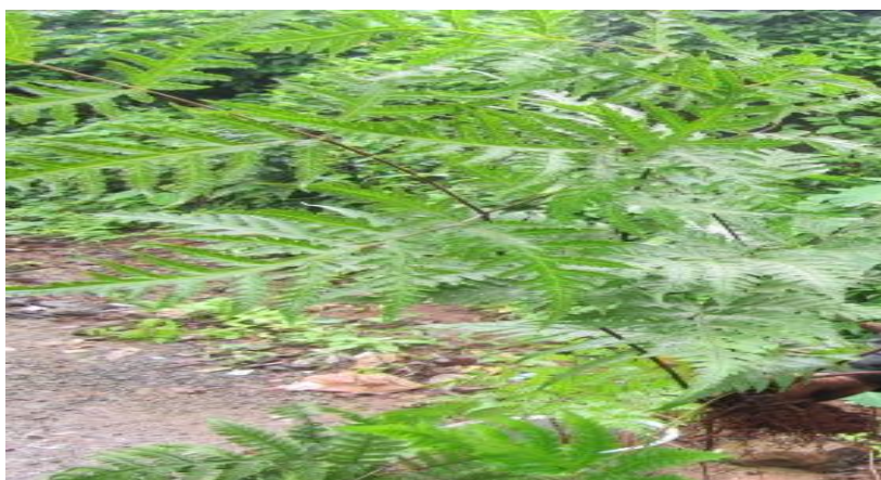
Figure no. 1- Kukutnakhi Aspidium cicutarium L. – whole plant