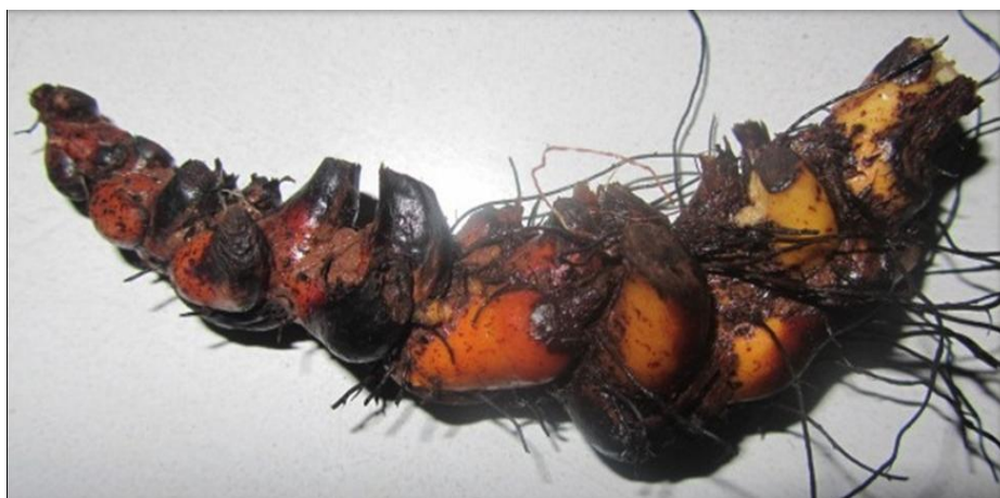
Figure no.2 freshly collected Kukutnakhi Aspidium cicutarium L. root rhizomes