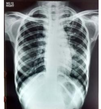
Fig No: 3 Mediastinal widening and bilateral infiltrates