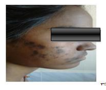
Fig No:2Hyperpigmented Skin Rashes on face