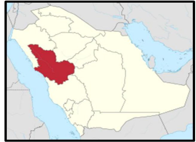
Figure 3: Madinah region

Placenta previa was defined as a condition where the placenta lies low in the uterus, while partially or completely covering the cervix. The patients were diagnosed with placenta previaby RIC5-9-D transvaginalprobe and C4-8-D transabdominal probe using Voluson E6 ultrasound system (GE Healthcare) in the third trimester. Placenta accreta is diagnosed using gray scale ultrasound and the suggestive signs of placenta accreta were presence of placental vascular lacunae, loss of a sonolucent area, interruption of bladder-uterine serosa and visualization of a focal protruding mass between the placenta and bladder. Diagnosis were confirmed by Magnetic resonance imaging (MRI) within 1 week of the ultrasound and intraoperative.