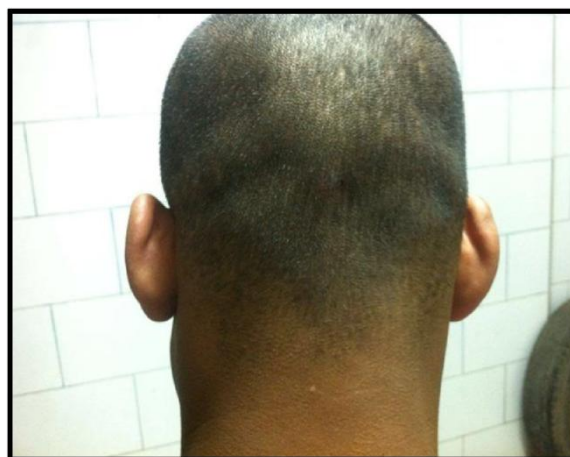
Figure 4. After 6 months of treatment