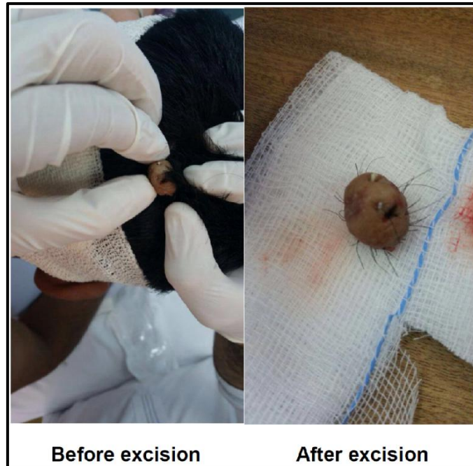
Figure 2: Exam showed well-defined exophytic nodule in the posterior scalp

Histopathology revealed papillomatosis as shown (Fig. 3A). Multiple nests of melanocytes were located intradermally, and associated with a pattern of cords, strands between collagen bundles, and nests of melanocytes within the papillary dermis (Fig. 3 B and C).