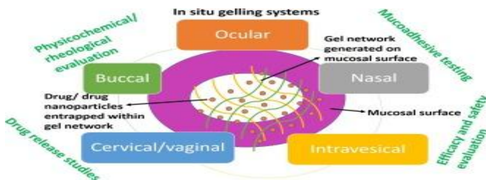
Figure 1. Insitu gelling Systems: Methodology

Keywords: Sustained release, biodegradable polymer, mucosal absorption, thermal triggered, pH triggered system