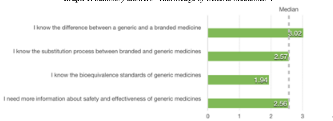
Graph 1. Summary answers “Knowledge of Generic Medicines”.

Difference between Generic and Branded medicines. Over 80% of nurses surveyed to know the difference between a generic and a branded medicine (71 agree and 35 people strongly agree). An average of 3.02 value out of 4 was the result on the knowledge of the differences between them.